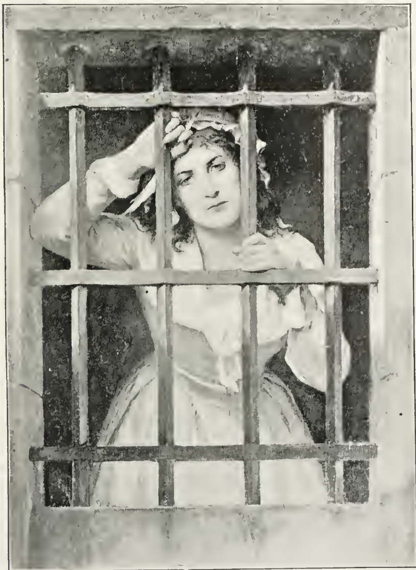
CHARLOTTE CORDAY IN PRISON.